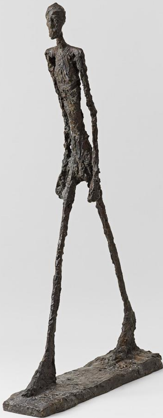
Alberto Giacometti, L'homme qui marche II, 1960, bronze.