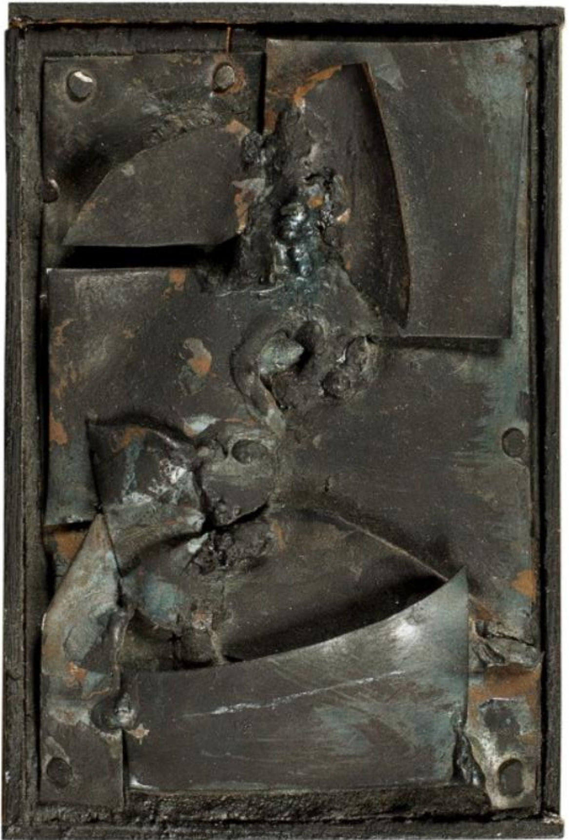
Alberto Burri, Ferro, 1959.